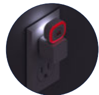
Use it as a night-light when traveling by plugging it into a USB wall charger (not included)